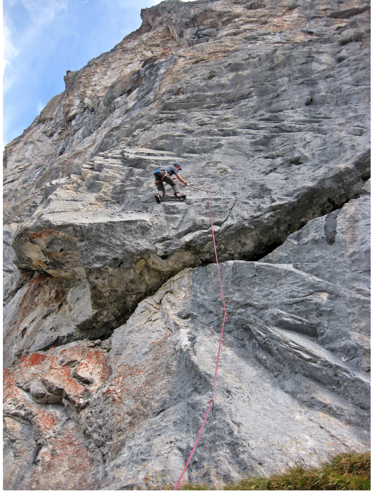
The crux section of P1.