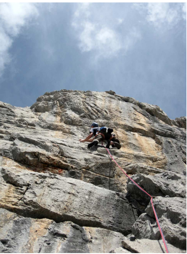
The difficult slab section in P5.