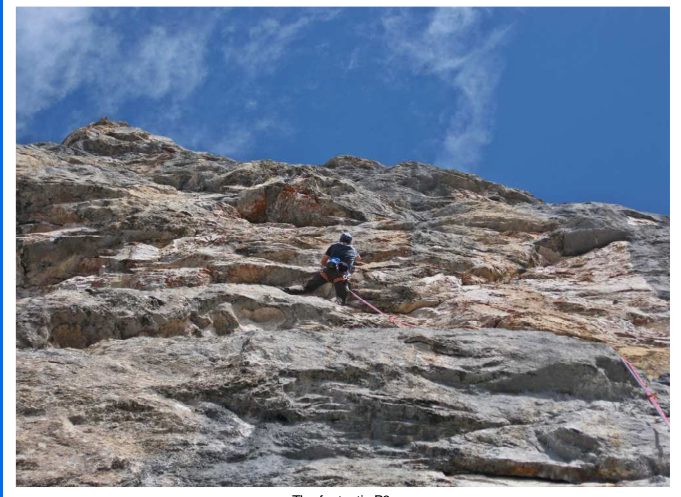
The fantastic P3.