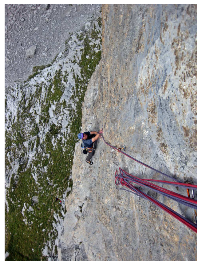
P2 - very rough with tiny holds.