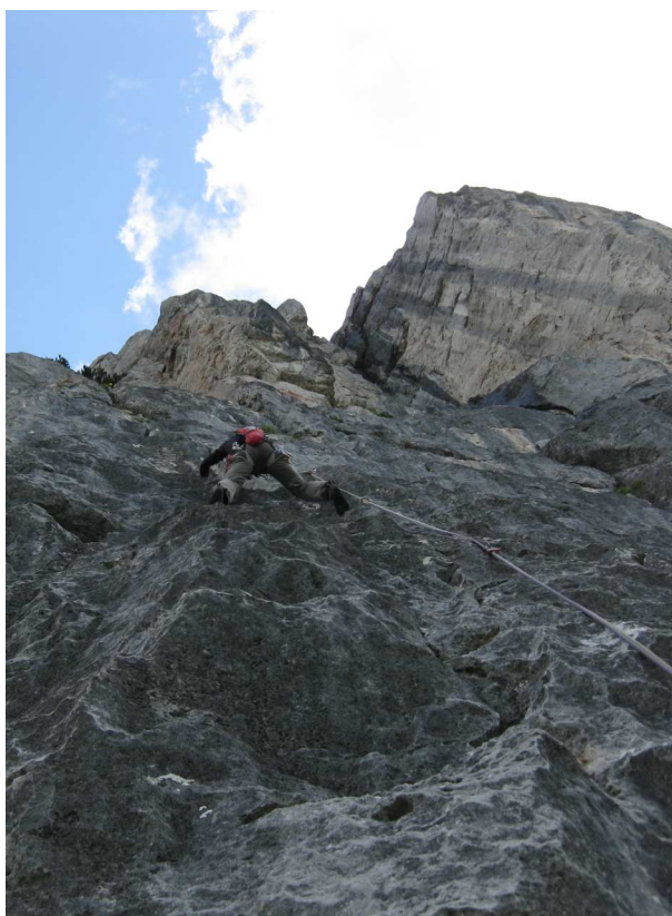
In the route "Dunnaweda" shortly before the tricky passage of P2.