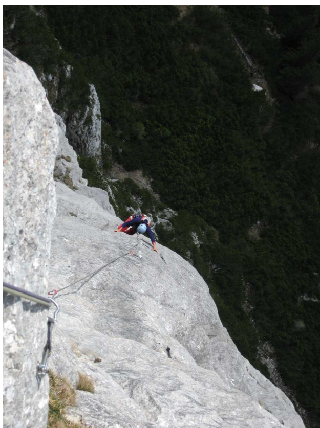
In the long slab pitch P6.