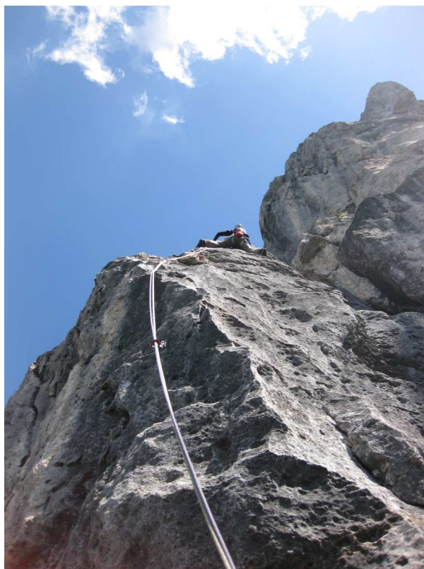
In P4 along the arete in the best of rock.