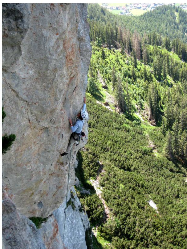
The actual crux in P3.