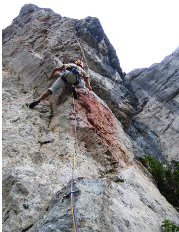
The first hard section in the crux pitch P3.