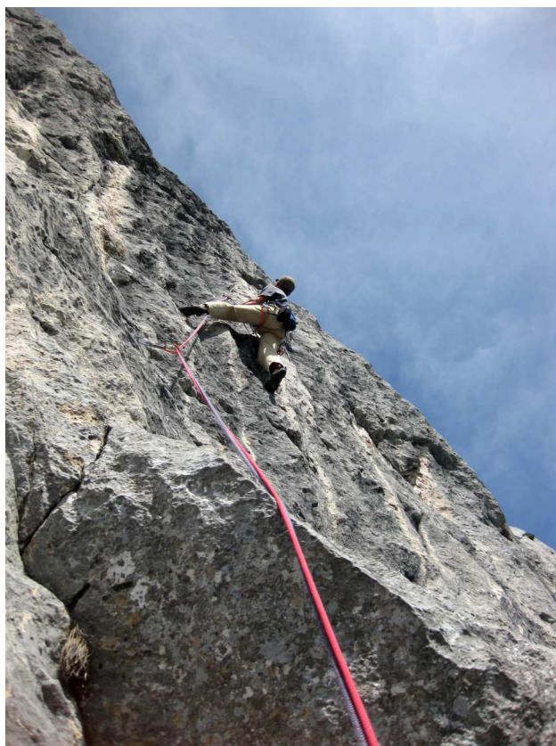
The crux in P7.