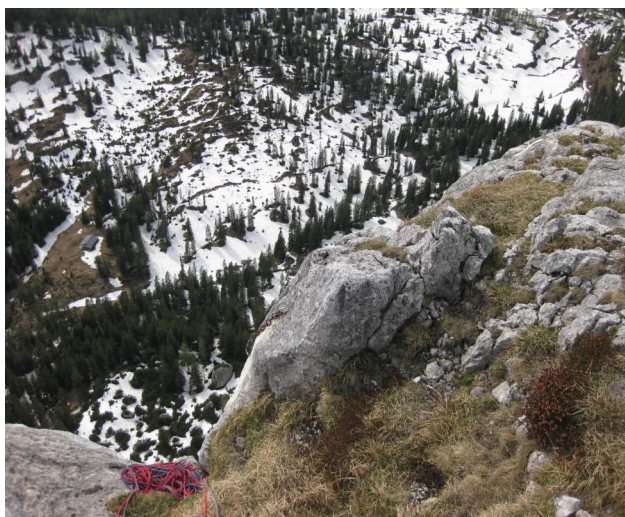
The rappel belay on the pillar of "Ironmouse" from where you reach the start of "Kraft der Worte" . Far below, the Grünwaldalm can be seen.