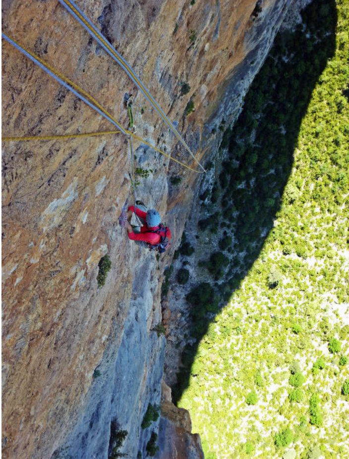
P8 (Artisan): steep and technical.