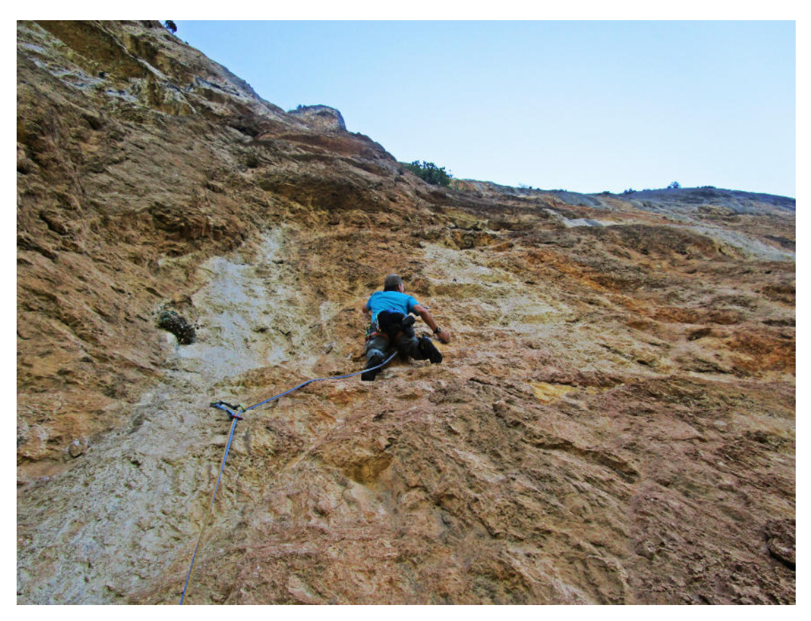
The beginning of P3 of Saga.