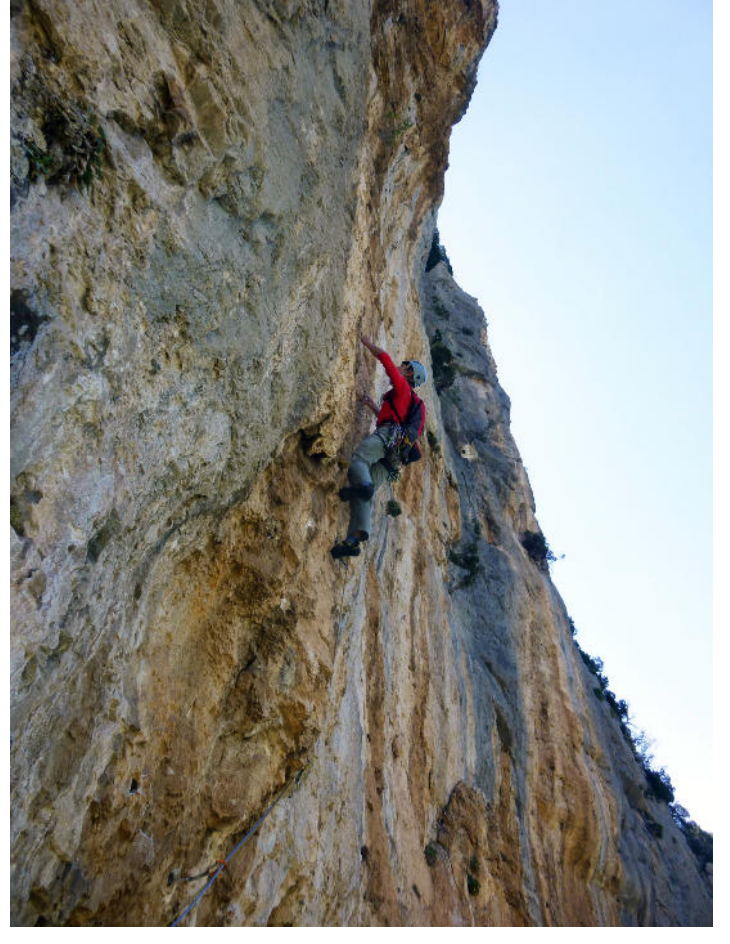
Athletic climbing on good holds in P5 (Dissipation).