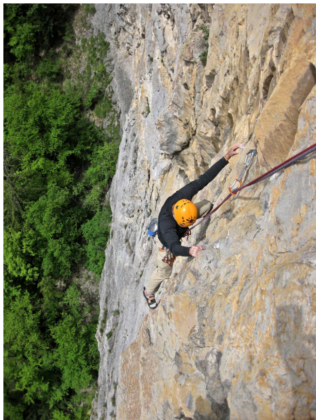
At the end of P2.