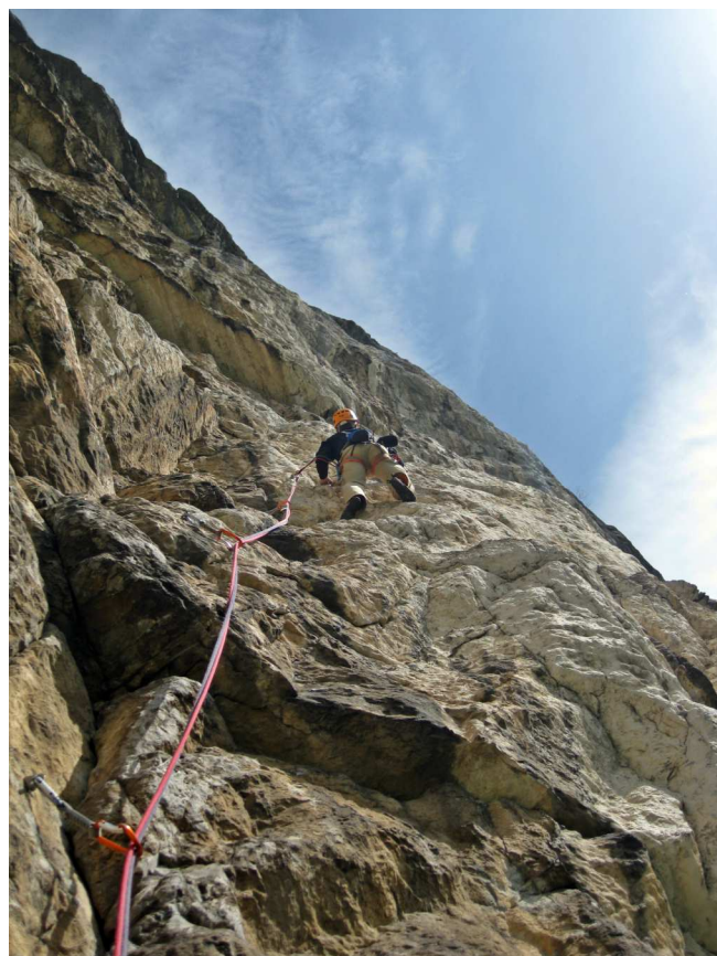
The grand P3.