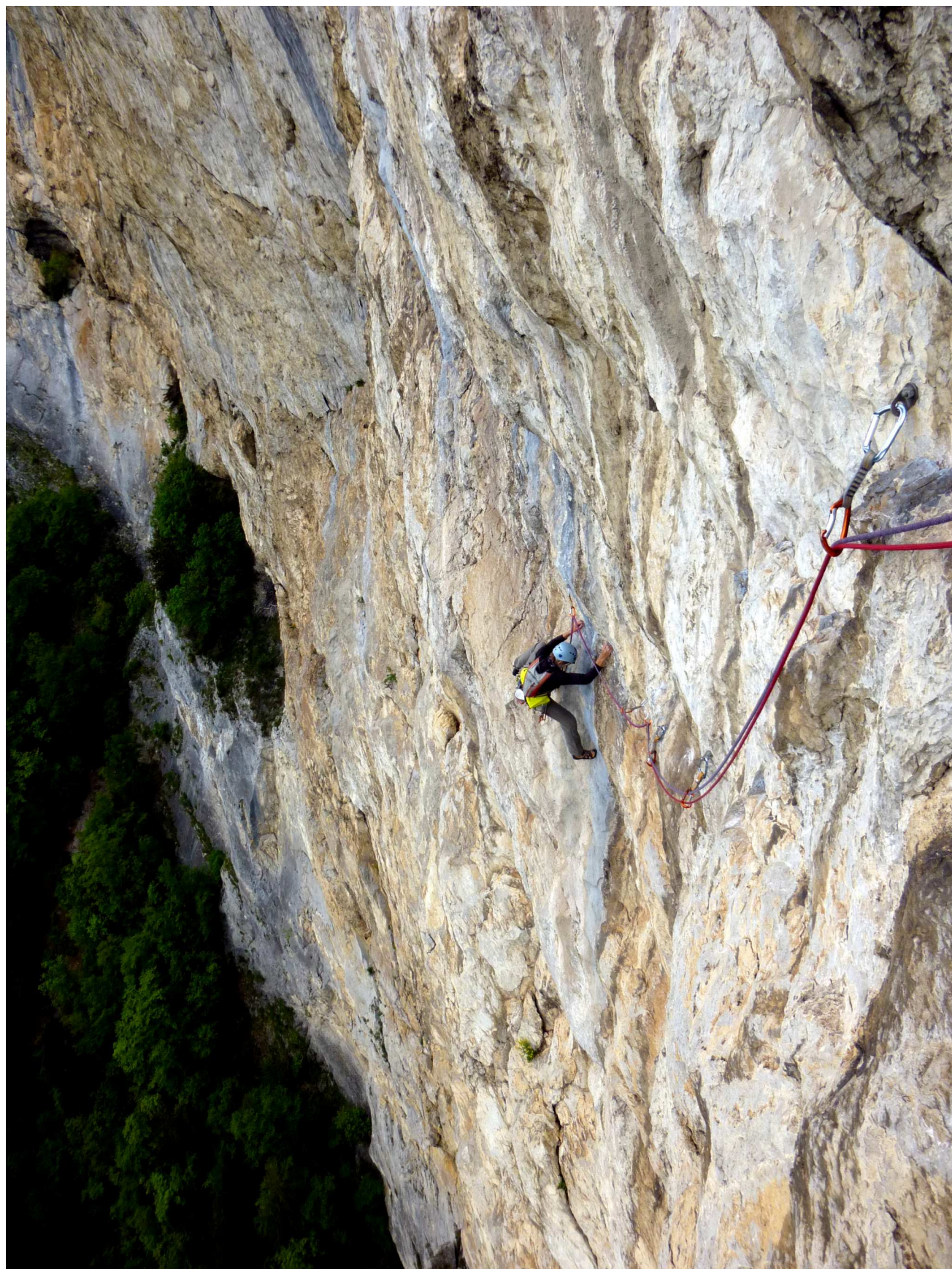
In the impressive traverse of P7.