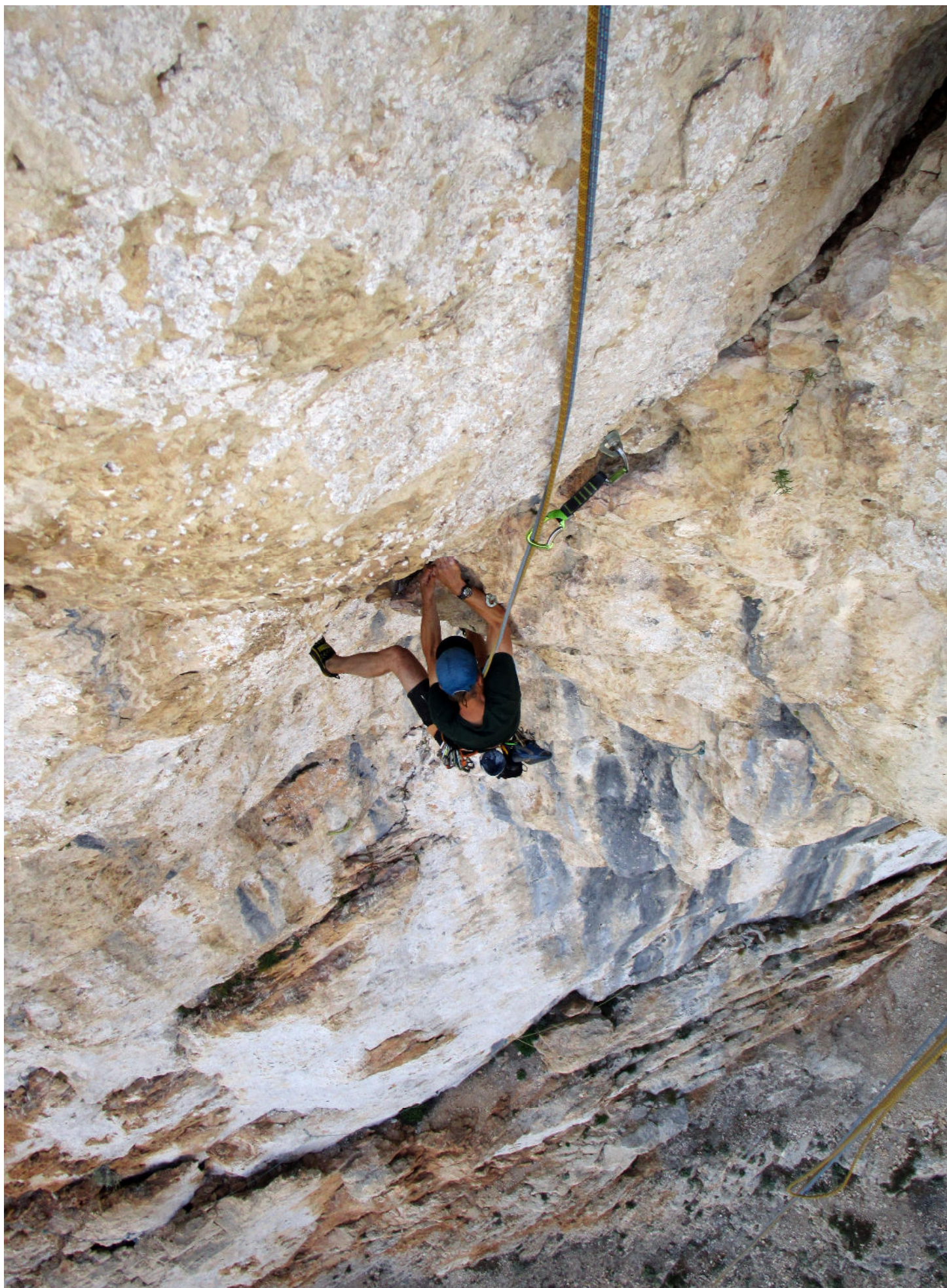
The overhanging crack of P2.