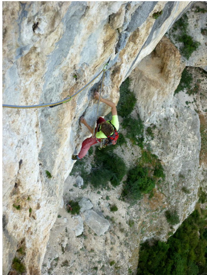
At the end of the difficulties of P3.