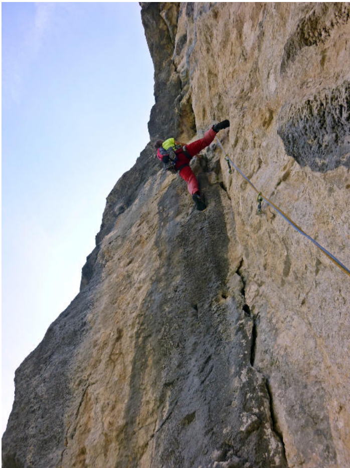
The lay back in P4. Way up one can see the right traverse below the roof.