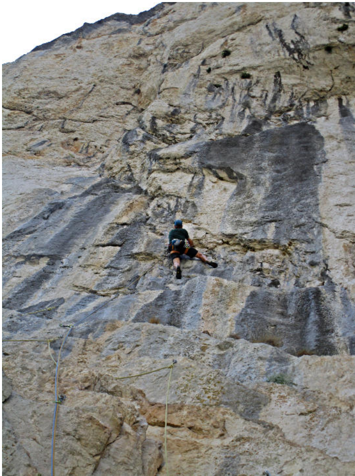
In the lower part of P1 where the steepness begins. One can see the course of the route up to P4.