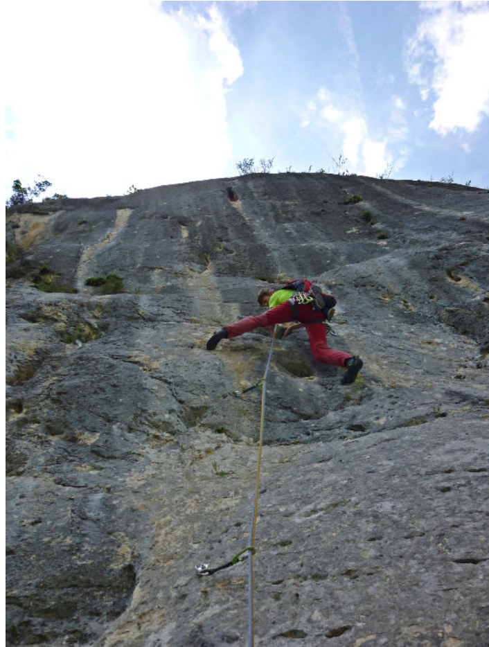
The wonderful gray wall with holes of P6.