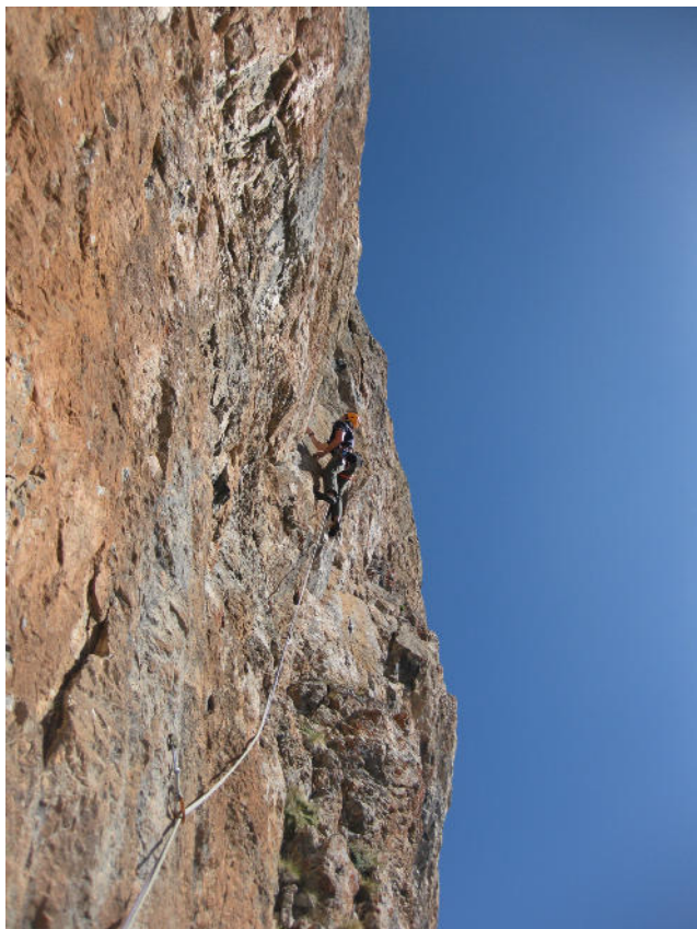
In the easy P7 after the crux pitch.