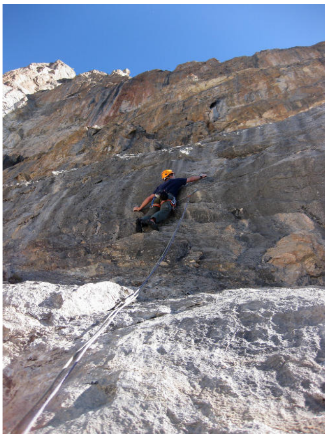
P1, the start of the route which leads to the ledge.