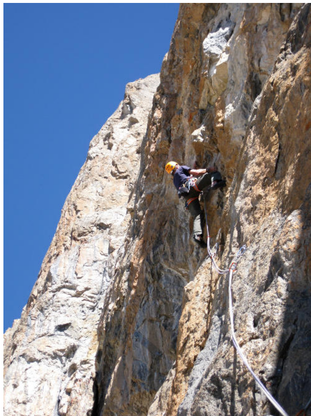
The fantastic P3.