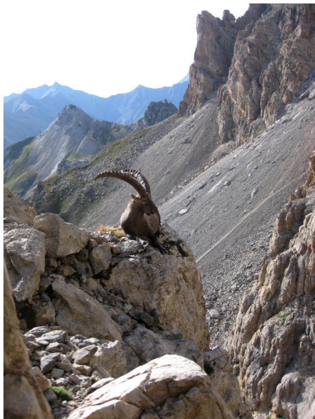
Grand encounter on the descent path.