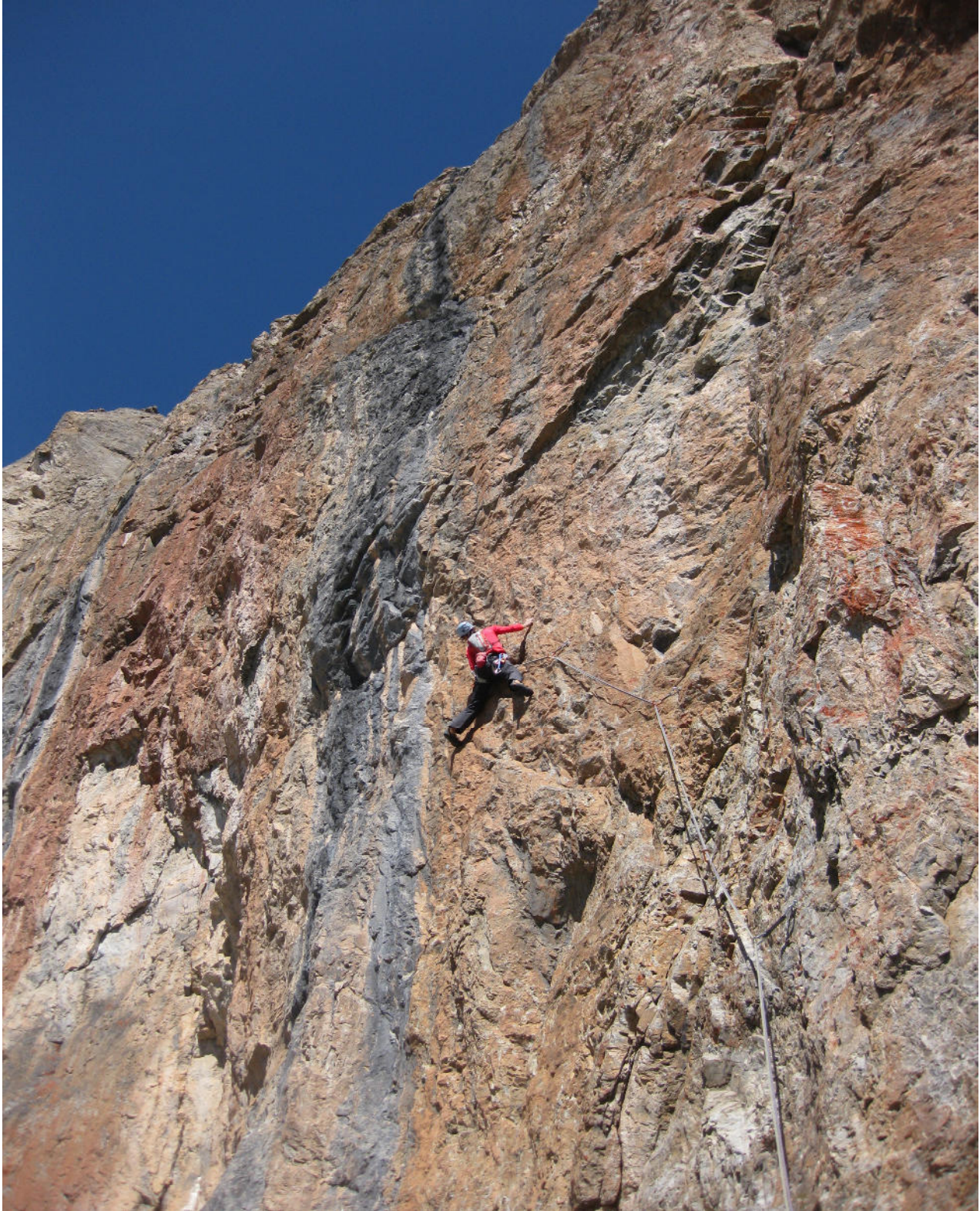
The incredibly good P6 with the well-protected 7b+/7c crux.