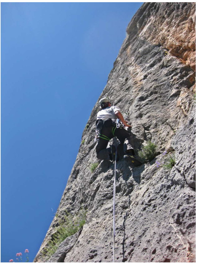
Few meters before the mandatorily bolted 6c+ section of P7.