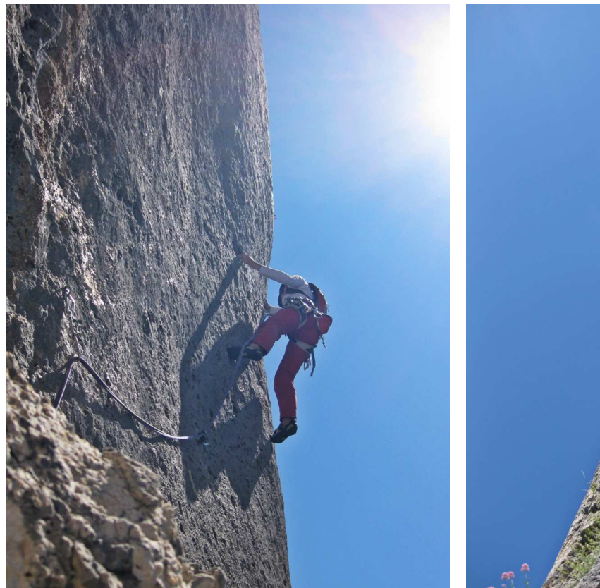
The traverse of P6 in the gray rock that is typical for L'Escalès.