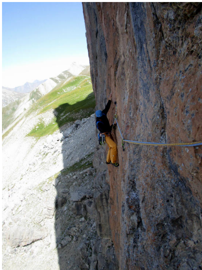
The difficult right traverse in P2.