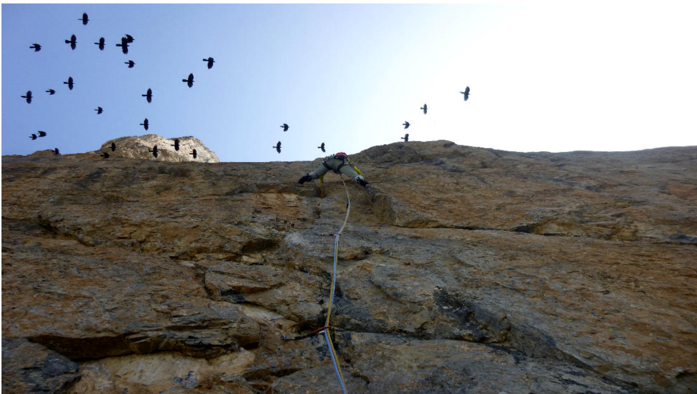
'Sous l'Oeil des Choucas' in the incredible crack pitch P4.