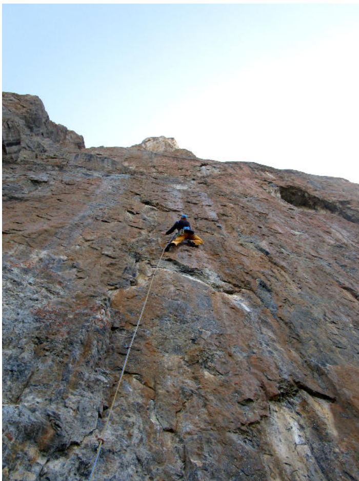
In P1 about 3 meters before the crux.