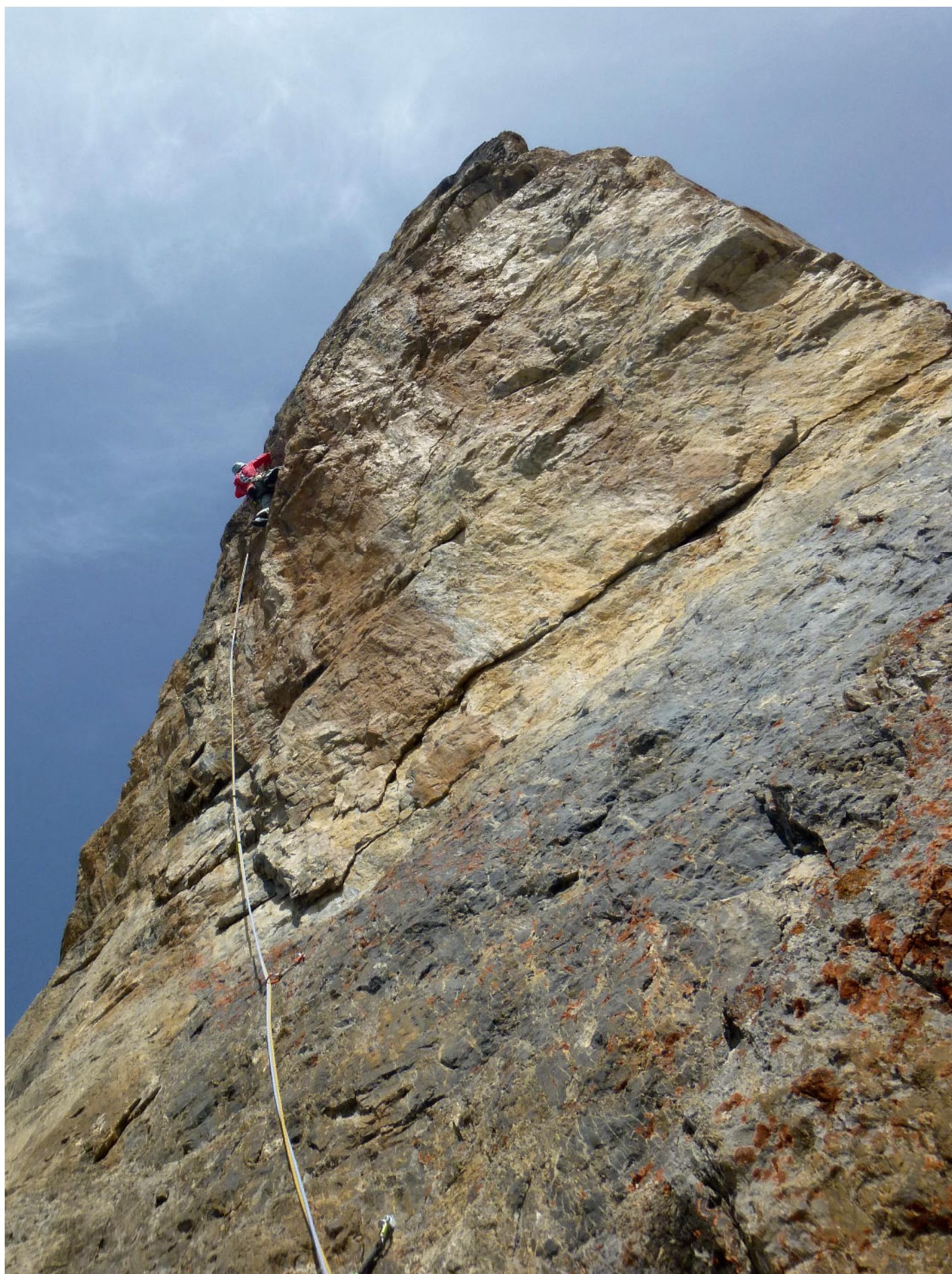
The exposed and esthetic P10.