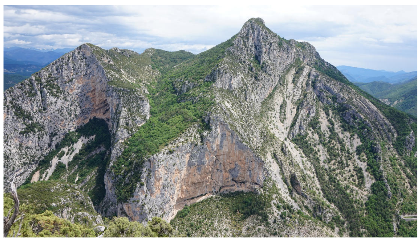
In the foreground the Paroi du Giet where the Cocotte is located on the left part of the wall, left of it in the background the Paroi Dérobée.