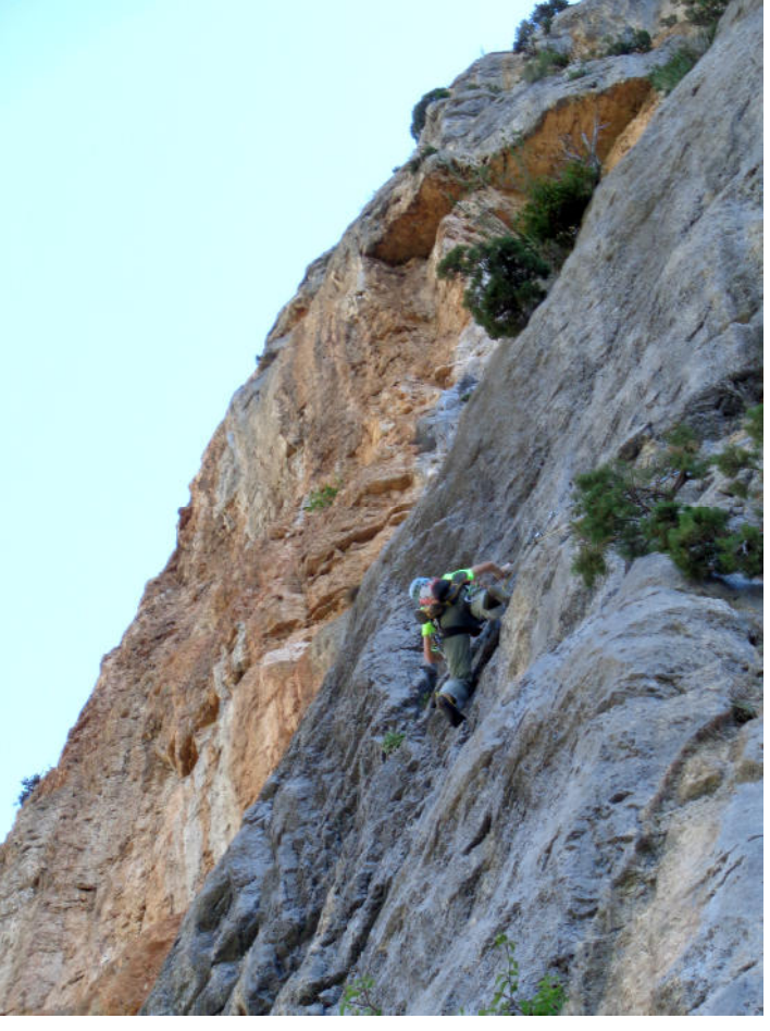
In the marvelous P5 with its good holds . P6 leads over the pillar (partially obscured by the bush) and ends over the roof.