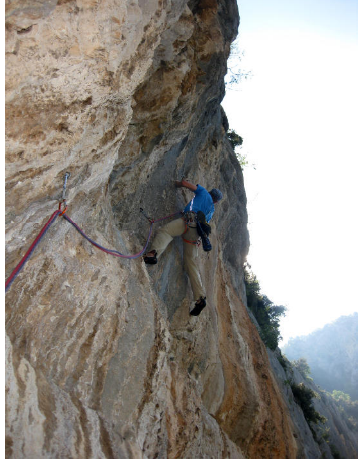
The beginning of P8 after the intermediate belay.