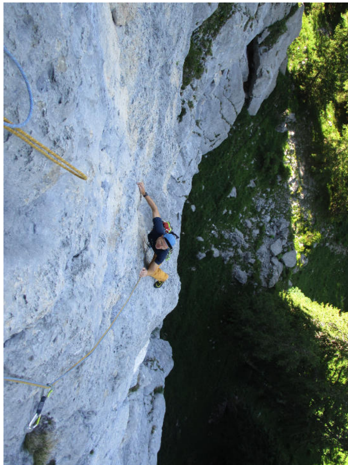
The steep gray wall in the upper part of P2.