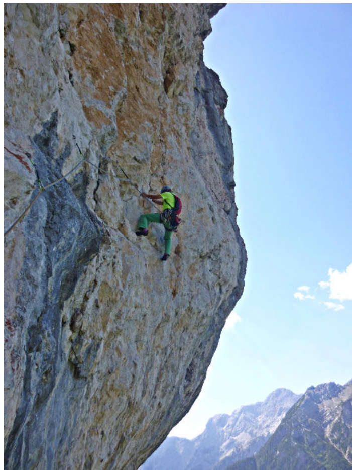
Before the crux in P4.