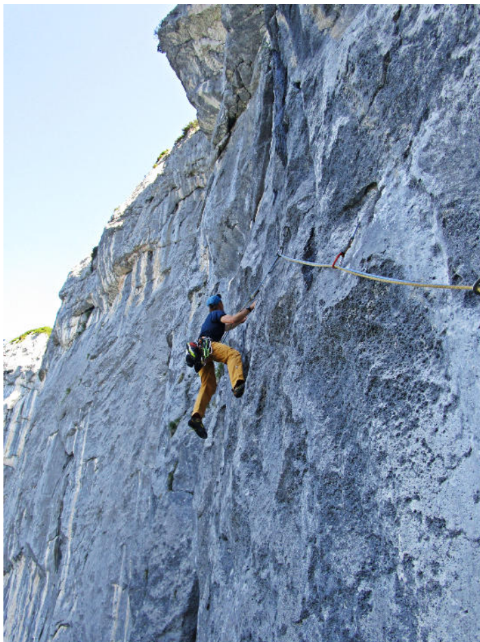
In the left traverse at the beginning of P1.