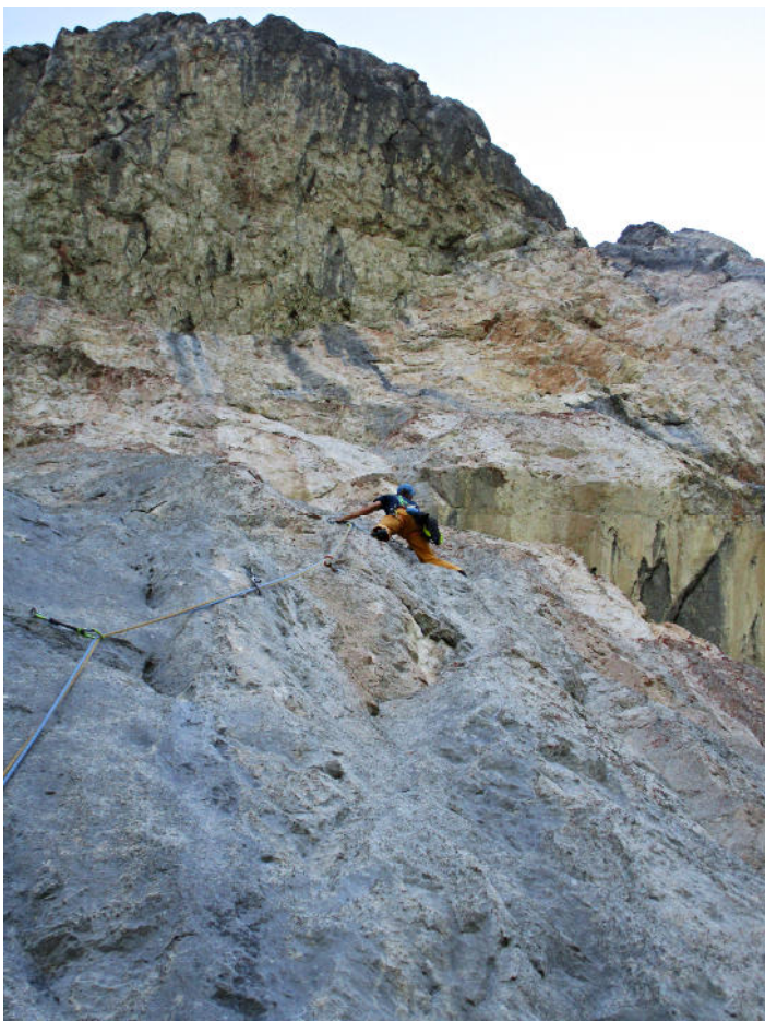
Small holds in the lower half of P3. The main difficulties begin in the yellow rock.