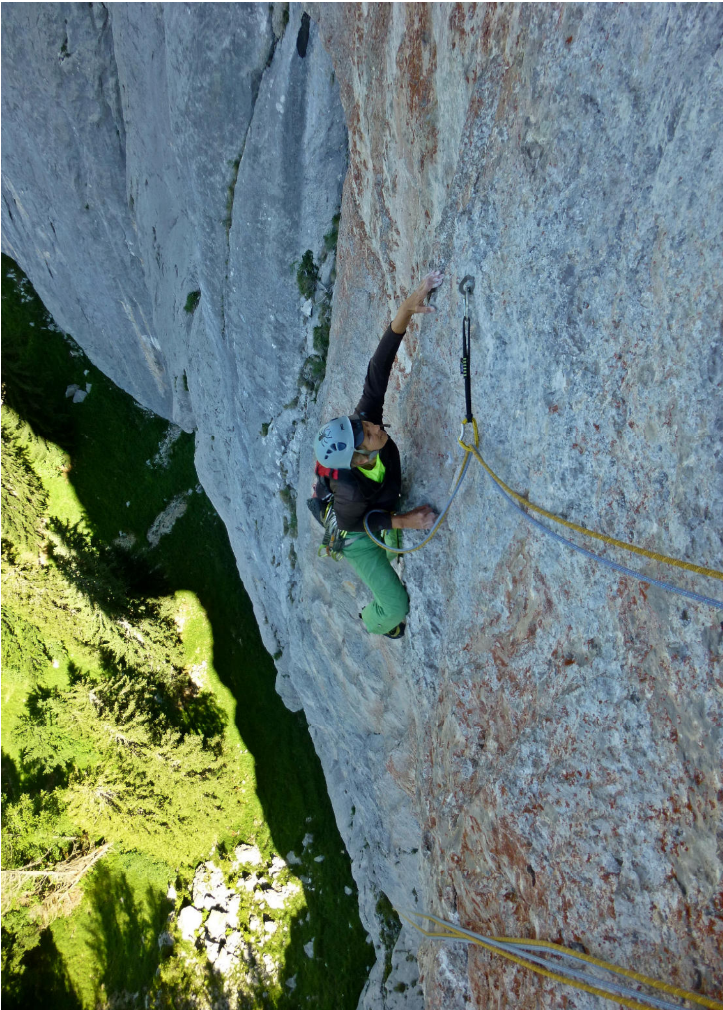
The difficult upper part of P3.