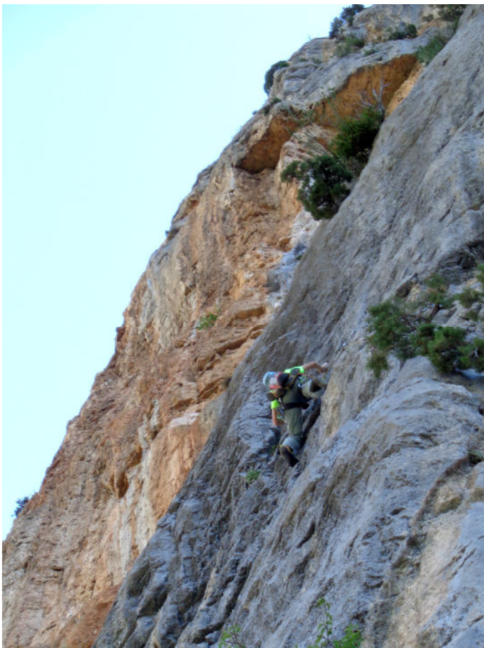
In the marvelous P5 with its good holds . P6 leads over the pillar (partially obscured by the bush) and ends over the roof.