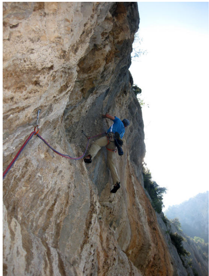
The beginning of P8 after the intermediate belay.