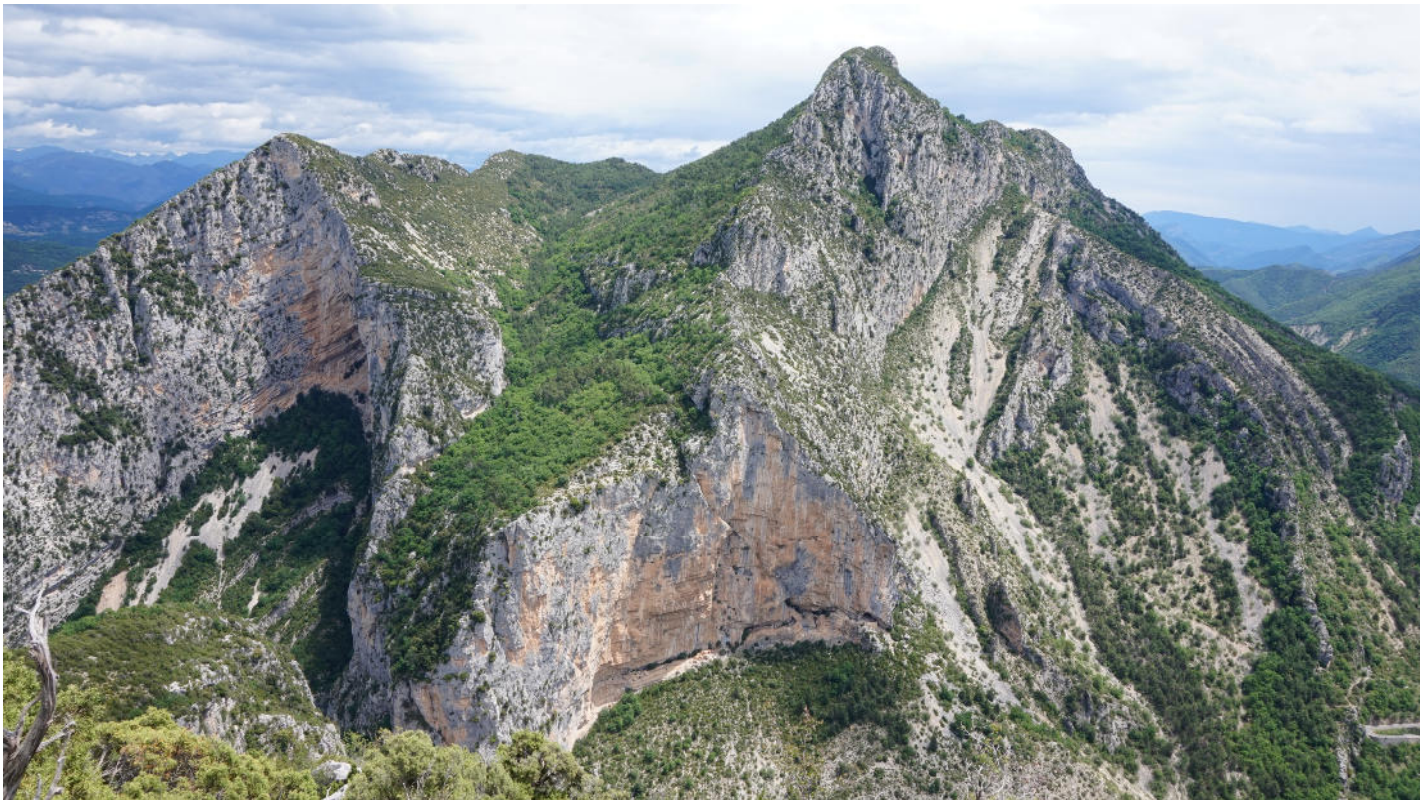
In the foreground the Paroi du Giet where the Cocotte is located on the left part of the wall, left of it in the background the Paroi Dérobée.